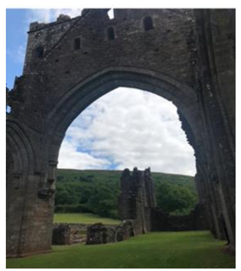
OFFA'S DYKE CHURCH CRAWL 9 September 2023

I have been asked if I would organise another Church Crawl, according to my records it is six years since the last one. So we will be doing another Crawl on 9 September, again around the Offa's Dyke area. We plan to visit Cwmyoy, Capel-y-Ffyn, Saint Davids at Llanthony Abbey, Patrishaw (Patriccio), and finish at St Mary's Priory Abergavenny.