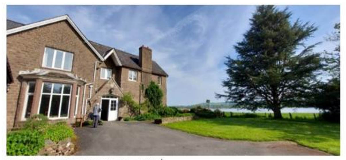
Llangasty Retreat House, Llangasty, Brecon, Wales