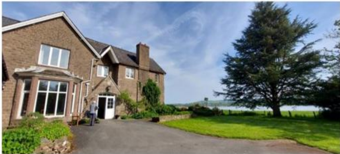
Llangasty Retreat House, Llangasty, Brecon, Wales