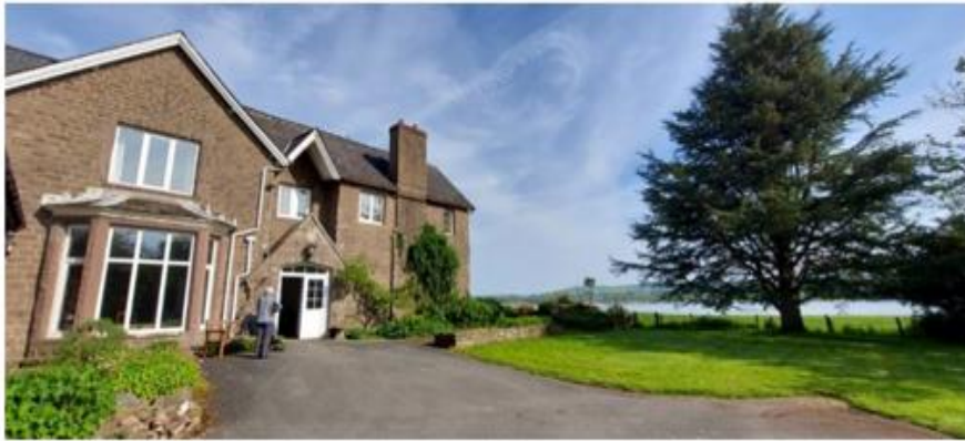
Llangasty Retreat House, Llangasty, Brecon, Wales