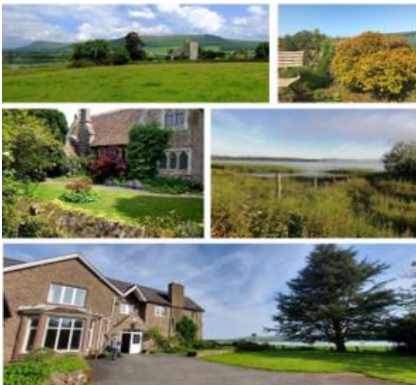
Llangasty Retreat House, Llangasty, Brecon, Wales!

There are still a few places left for this year's ASC Parish Retreat to Llangasty from 17 th -19 th May.