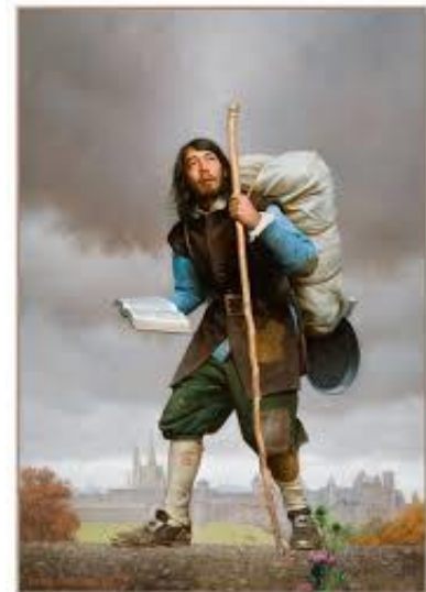
Christian looks for a way of escape outside the City of Destruction.

God is the source of all being, the one for whom we exist