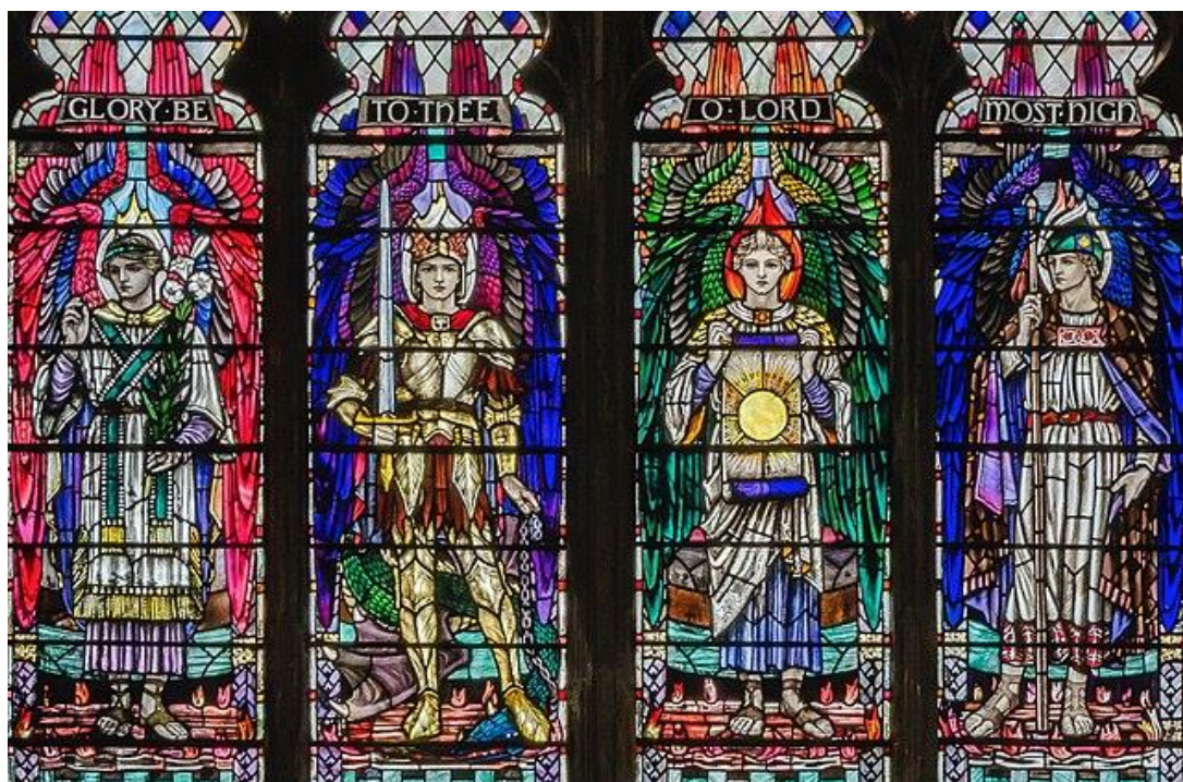
Windows at Holy Trinity, Kingston upon Hull, depicting Gabriel, Michael, Raphael, Uriel.

Raphael means, as I have said, God’s remedy, for when he touched Tobit’s eyes in order to cure him, he banished the darkness of his blindness. Thus, since he is to heal, he is rightly called God’s remedy.