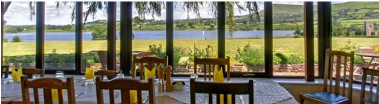
The View from the Dining Room

Fortunately, there is a vast range of retreat experiences from which we can select. Here at ASC some elect to go on the Parish Retreat, taking place this weekend at Llangasty Retreat House.