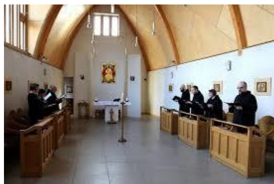
Mucknell Abbey Chapel

At these locations a retreatant is invited to share in the rhythm of the monastic day, which is structured around the daily “Office” (corporate, liturgical prayers), the celebration of the Eucharist, and communal meals. Outside of these times they hope to offer the space, solitude and quiet that so many guests find a source of renewal and healing. Others elect to go to a Retreat Centre such as Ammerdown or Sheldon (or indeed Elsie Briggs House) where space is provided to follow your own desired path.